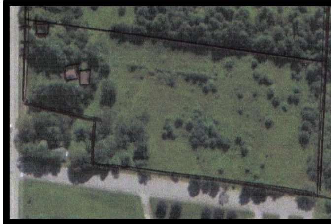
Arial photo of our 6 acres of land